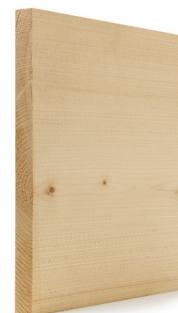
1" KNOTTY S1S2E TRIM BOARDS

1" KNOTTY S1S2E TRIM BOARDS 4", 6", 8", 10", 12"