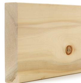
2" KNOTTY S4SEE