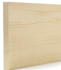
1" C&BTR S4S TRIM BOARDS

1" C&BTR S4S TRIM BOARDS 3", 4", 6", 8", 10", 12"