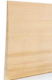
C&BTR BEVEL SIDING