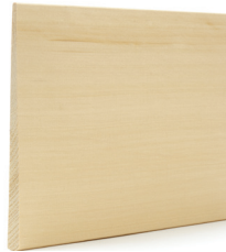
C&BTR BEVEL SIDING