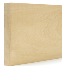
5/4" C&BTR TRIM BOARDS