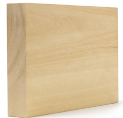
2" C&BTR S4S

5/4" C&BTR TRIM BOARDS 4", 6", 8", 10", 12"