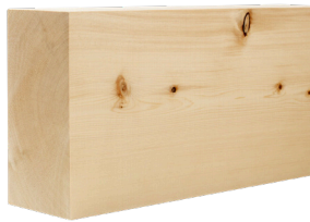
4 x 6, 8, 10, 12 Knotty S4S 6'-20'