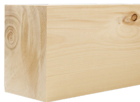
6 x 8 Knotty S4S 6'-20'