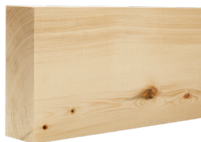
3 x 6, 8, 10, 12 Knotty S4S 6'-20'