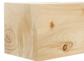
8 x 8 Knotty Rough 6'-20'